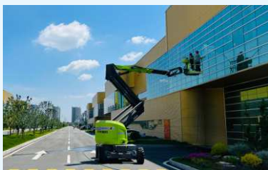
外立面清洁 Clean Service