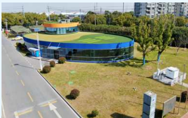
共享会议室 Reference room