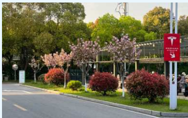
新能源充电桩 New Energy Charging