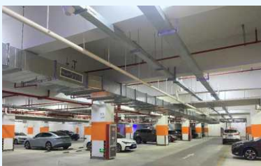
地下停车场 Underground Garage