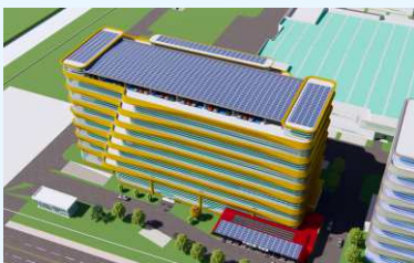
顶层金库AGV自动停车 AGV Roof Parking