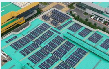
太阳能光伏安装 Solar Panels Installation